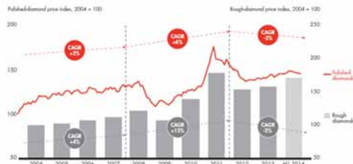
Figure 7.1.2: Rough- and polished-diamond price growth reverts to near its historic trajectory

http://www.bain.com/publications/articles/global-diamond-report-2014.aspx